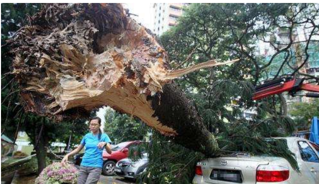
The 20m tree which fell and damaged three cars that were parked at Block 102 on Spottiswoode Park Road on Wednesday. The owners of the cars suspect termites were the reason for the tree falling.

The owners of the cars, which were parked at Block 102 on Spottiswoode Park Road, suspect termites caused the tree to fall, Shin Min Daily News reported.