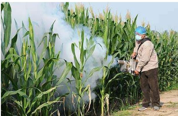
A farmer sprays pesticide in a corn field in Wangdou county, North China's Hebei province, Aug 13, 2012.

The ministry urged greater efforts to monitor and issue warnings for disease and pests, purchase pesticides and form specialized pest control teams.